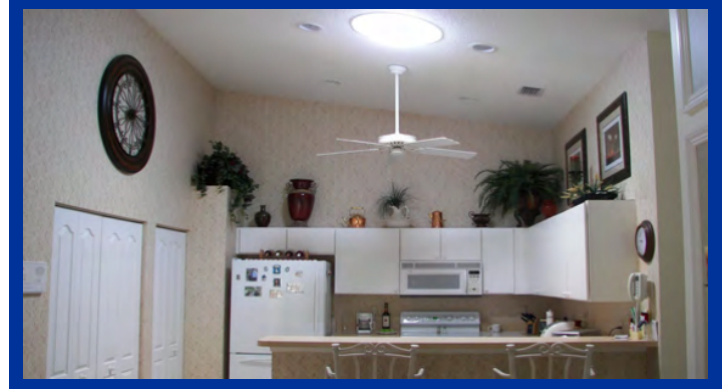
After Sun-Dome. No electric lighting.